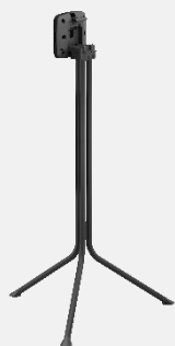
Flip top table– mod. BT002